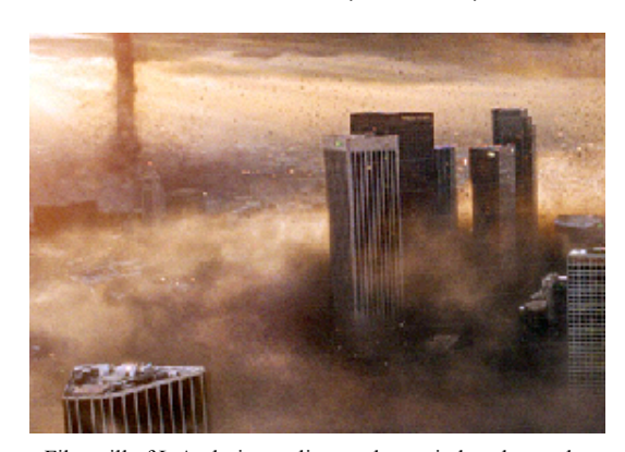
Film still of L.A. during a climate-change induced tornado from the new movie The Day After Tomorrow

--From the Pentagon Report; An Abrupt Climate Change Scenario and Its Implications for United States National Security Downloadable at Environmental Media Services: <a href="http://www.ems.org/climate/pentagon_climate_change.html">http://www.ems.org/climate/pentagon_climate_change.html</a>